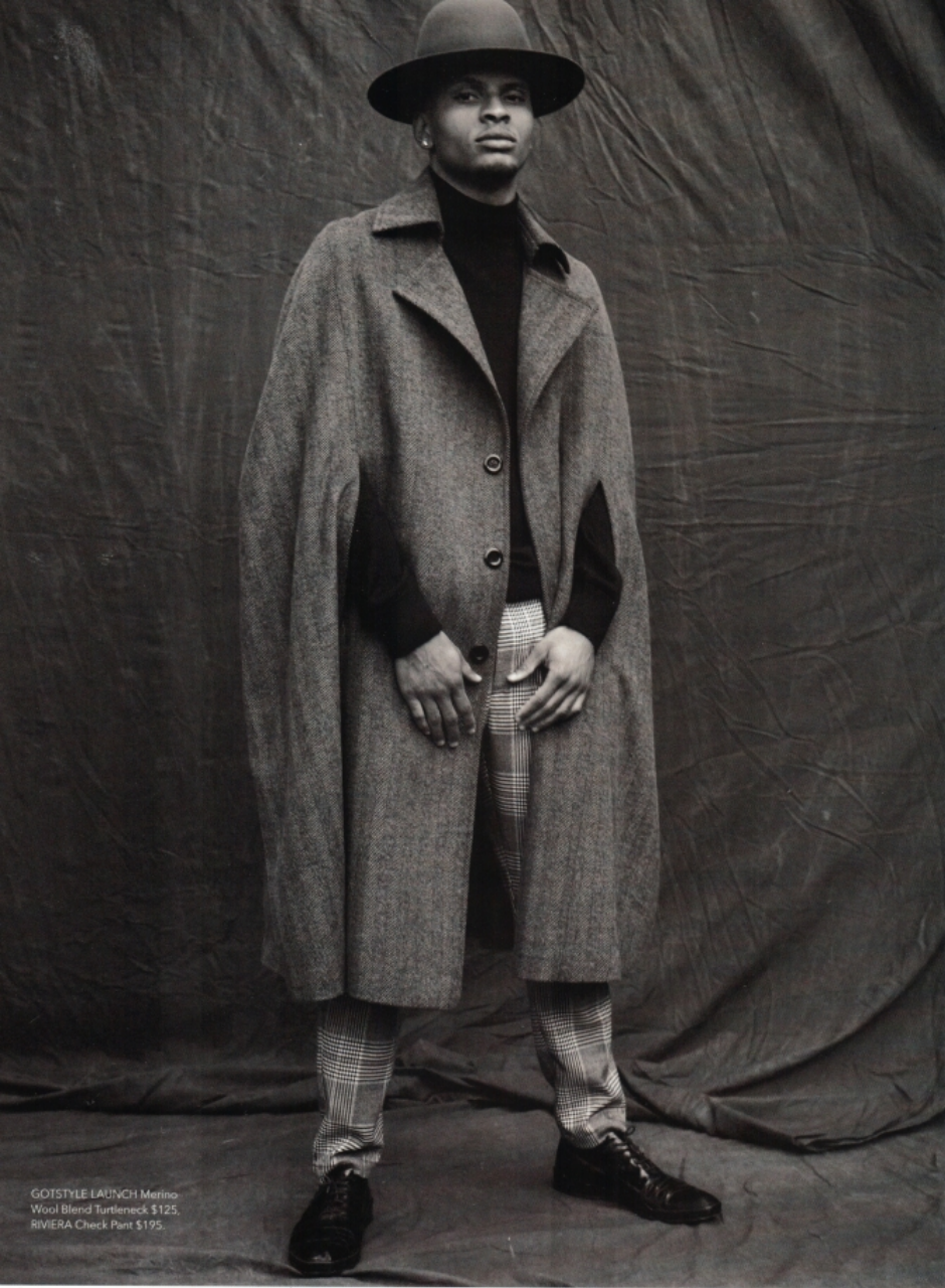
GOTSTYLE LAUNCH Merino Wool Blend Turtleneck $125, RIVIERA Check Pant $195.