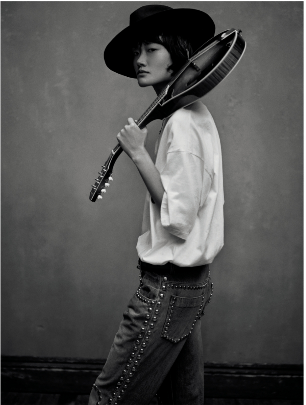
Tee-shirt en coton, jean en denim clouté et chapeau, GUCCI.